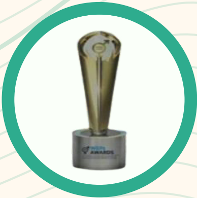
LEADERSHIP COMMITMENT UN WOMEN ASIA-PACIFIC WEPs AWARDS 2020

Even before and after its establishment, Biopac has participated in many competitions and won some prestigious awards.