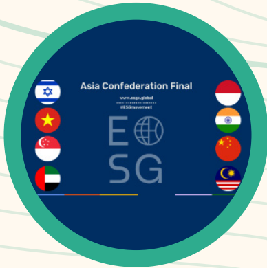
ASIA CONFEDERATION FINAL