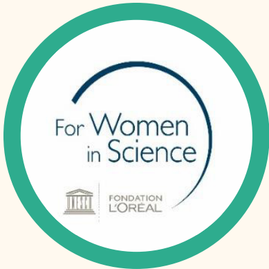
L'OREAL FOR WOMEN IN SCIENCE