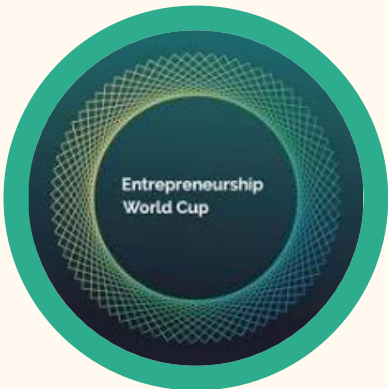
ENTREPRENEURSHIP WORLD CUP