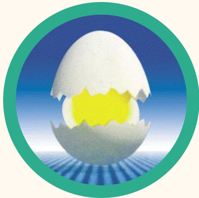
INDONESIA TORAY SCIENCE FOUNDATION