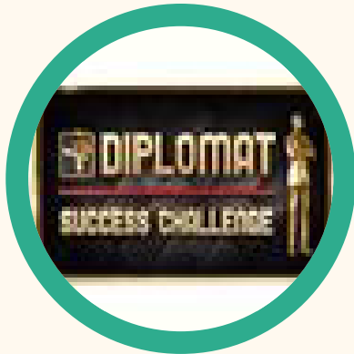
DIPLOMAT SUCCESS CHALLENGE SEASON 3